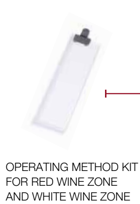
OPERATING METHOD KIT FOR RED WINE ZONE AND WHITE WINE ZONE