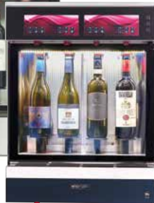
TWO-COLOUR BOTTOM DRAWER KIT