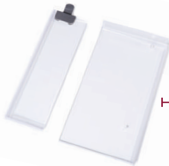
2+2 CONFIGURATION KIT