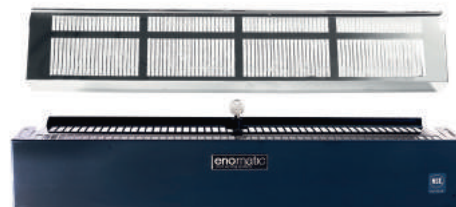
TWO-COLOUR BOTTOM DRAWER KIT